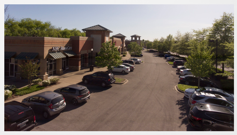
*The information contained herein has been given to us by the owner of the property or other sources we deem reliable. We have no reason to doubt its accuracy, but we do not guarantee it. All Information should be verified prior to purchase or lease.