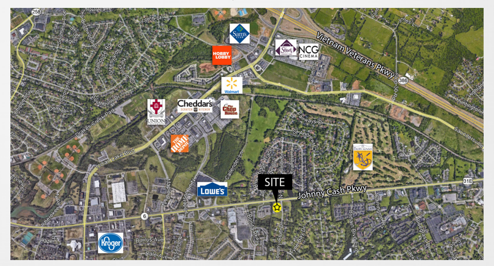
*The information contained herein has been given to us by the owner of the property or other sources we deem reliable. We have no reason to doubt its accuracy, but we do not quarantee it. All Information should be verified prior to purchase or lease.